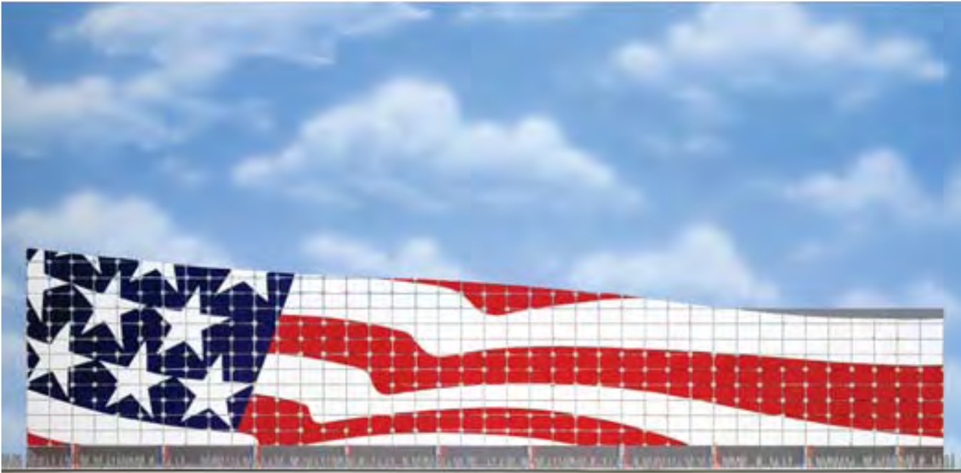
ELEVATION UNITED STATES PAVILION-EXPO '92