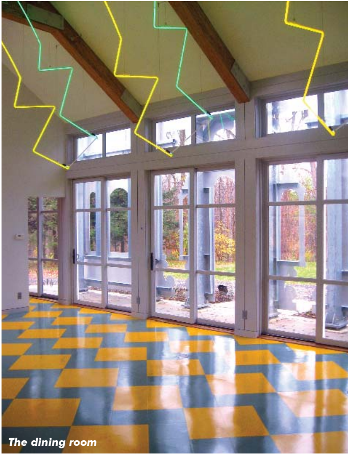
The dining room