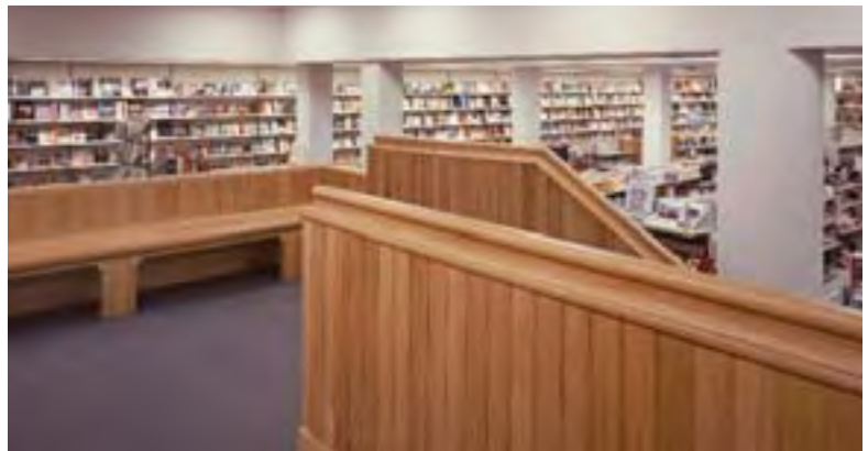
Corridor, Cafe, & Bookstore