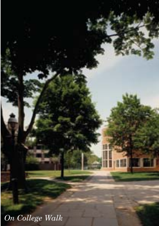
On College Walk