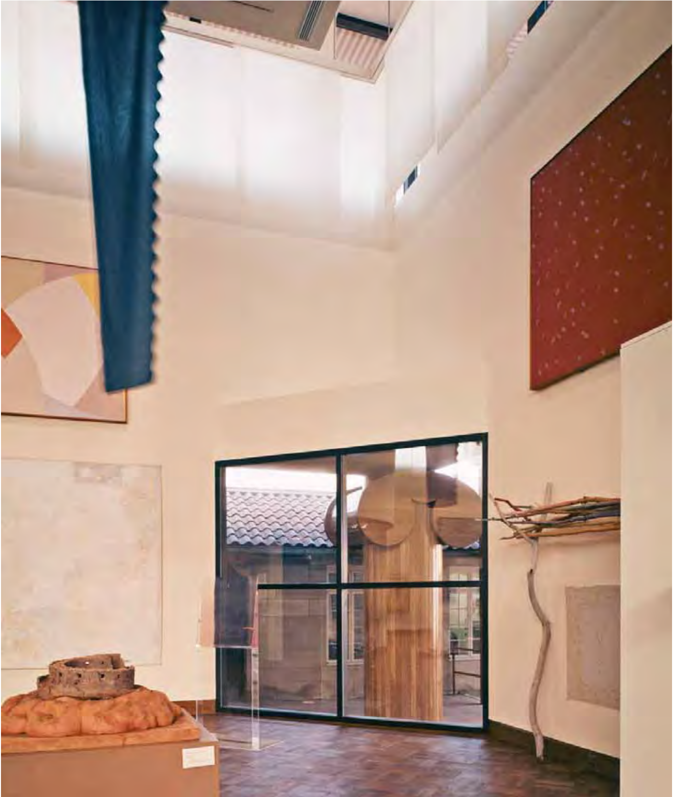
Allen Memorial Art Museum Oberlin College