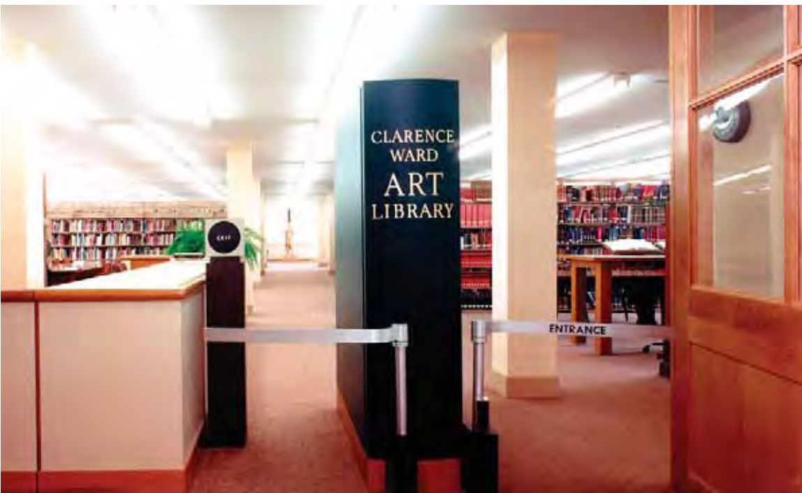
Painting studio and art library