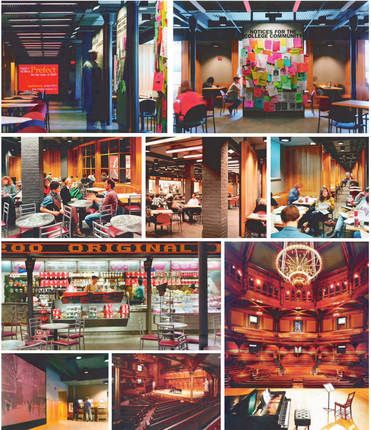
Lokor Commons -- study areas, traditional info board, servery and study areas, LED info wall display, e-mail stations -- and Sander's Theater