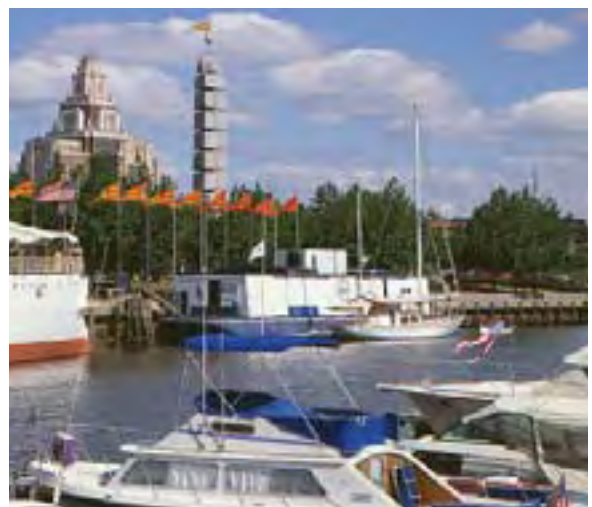
As seen from the harbor