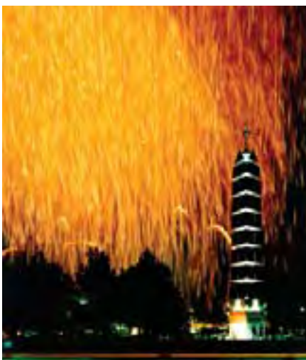
Views of the monument by night and day