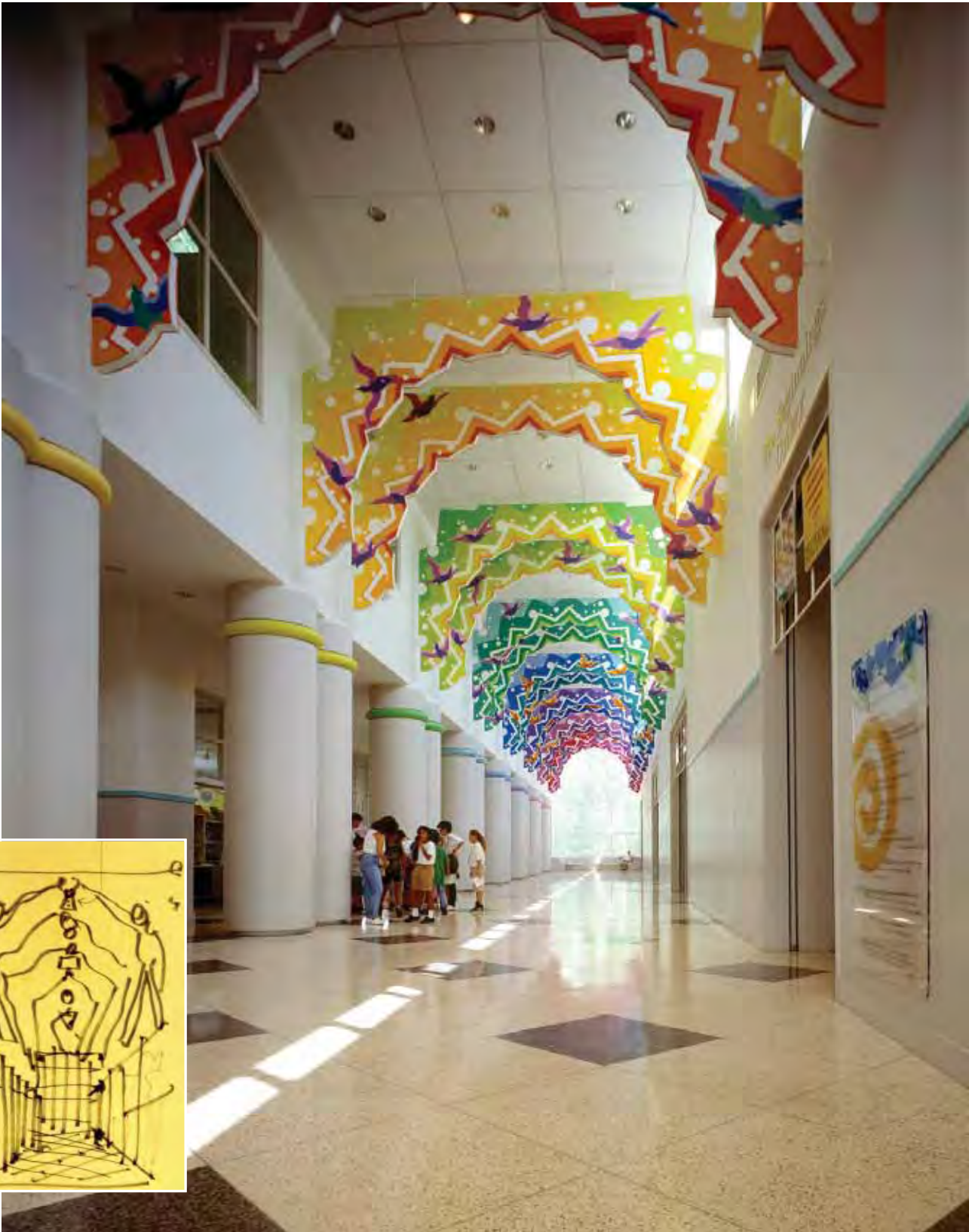
The Children's Museum of Houston