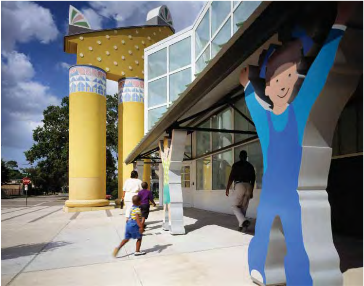
The Children's Museum of Houston