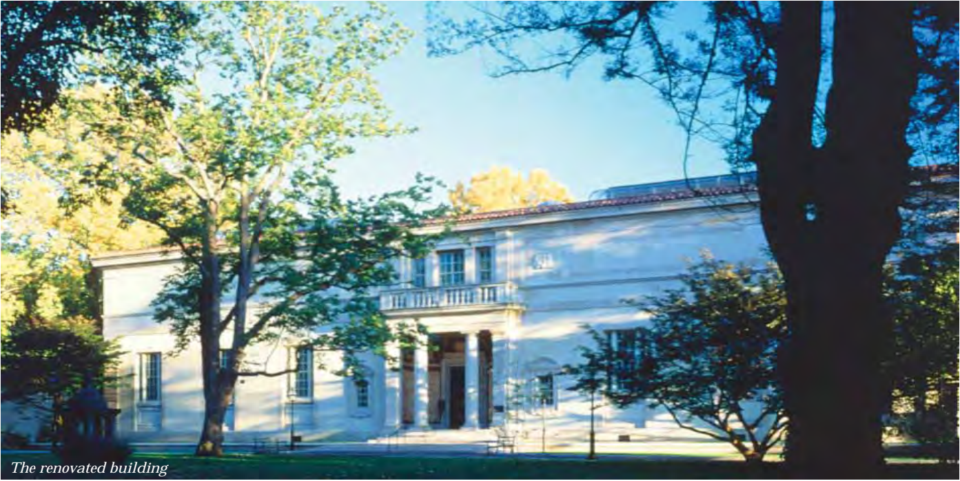
The renovated building