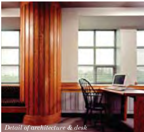
Detail of architecture & desk

Inside, the addition’s varied and naturally lit perimeter spaces serve specialized academic and administration functions while uniform internal structural bays efficiently house the book and manuscript collections. Electrical and communications provisions throughout the perimeter and reference areas meet current and anticipated developments in information technology and library practices. Each floor offers views of the adjacent Classical temple.