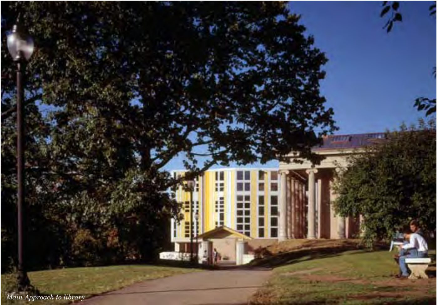
Main Approach to library