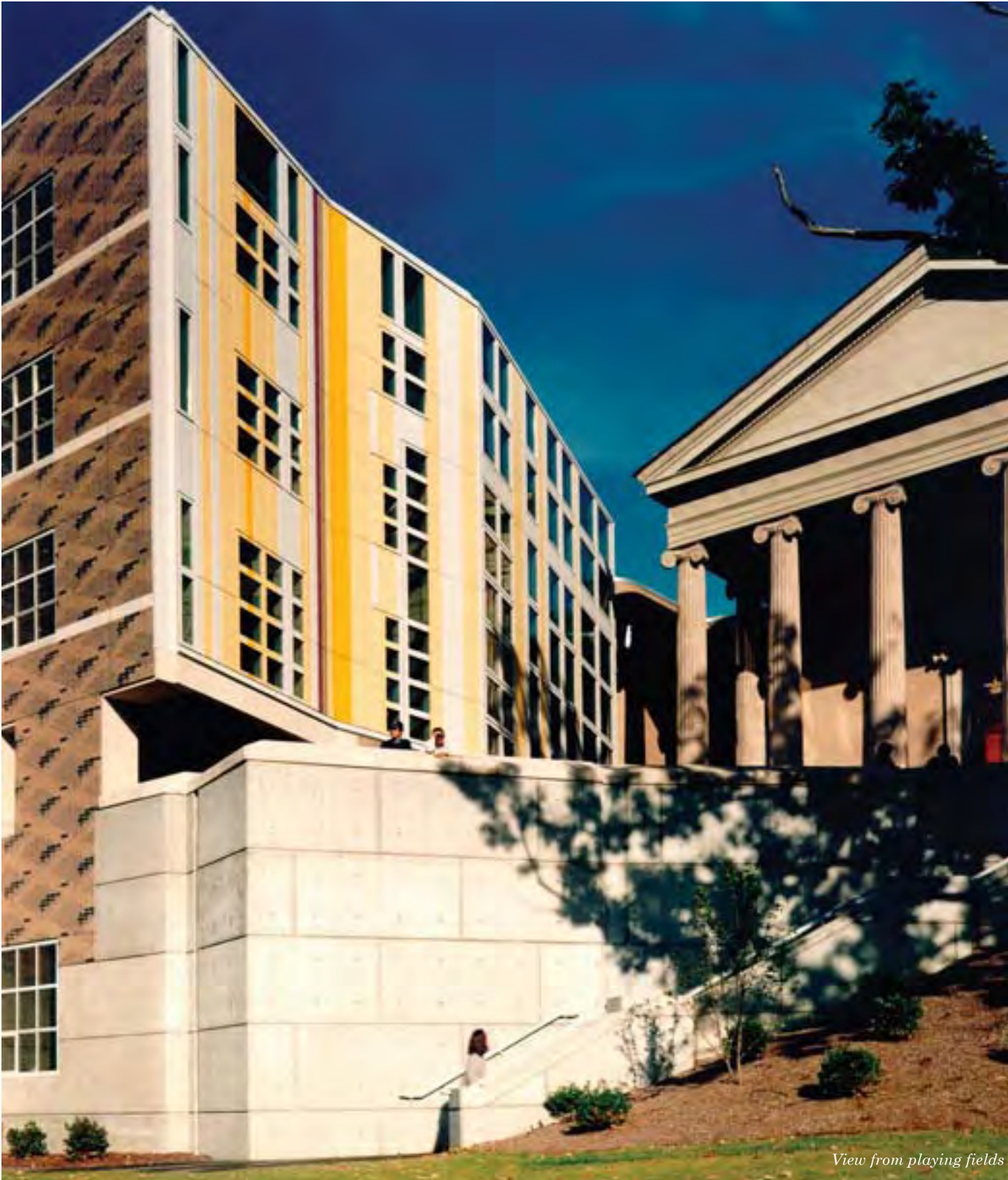
View from playing fields