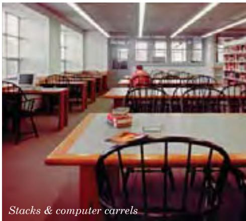
Stacks & computer carrels

Situated on a bluff overlooking the Hudson Valley, the 1893 Greek Revival Hoffman Library has been a stirring tribute to Classicism for over a century. Bard College retained VSBA to expand and renovate the library into a state-of-the-art complex serving as campus’s intellectual and symbolic focal point. Design requirements included doubling the size of the library to accommodate 230,000 volumes and 400 users, expanding computer capabilities, providing specialized study and seminar rooms, improving acoustics, introducing new mechanical systems, and integrating the new addition with the original Greek Revival temple. The extension also had to relate to the loft-like Kellogg Wing, a 1974 addition to the north of the Hoffman original.