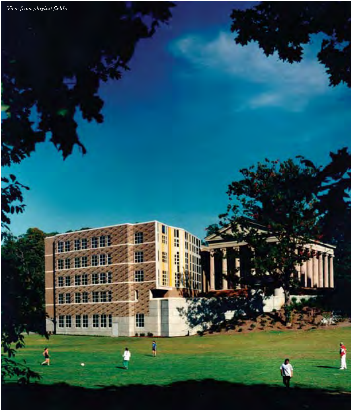
View from playing fields