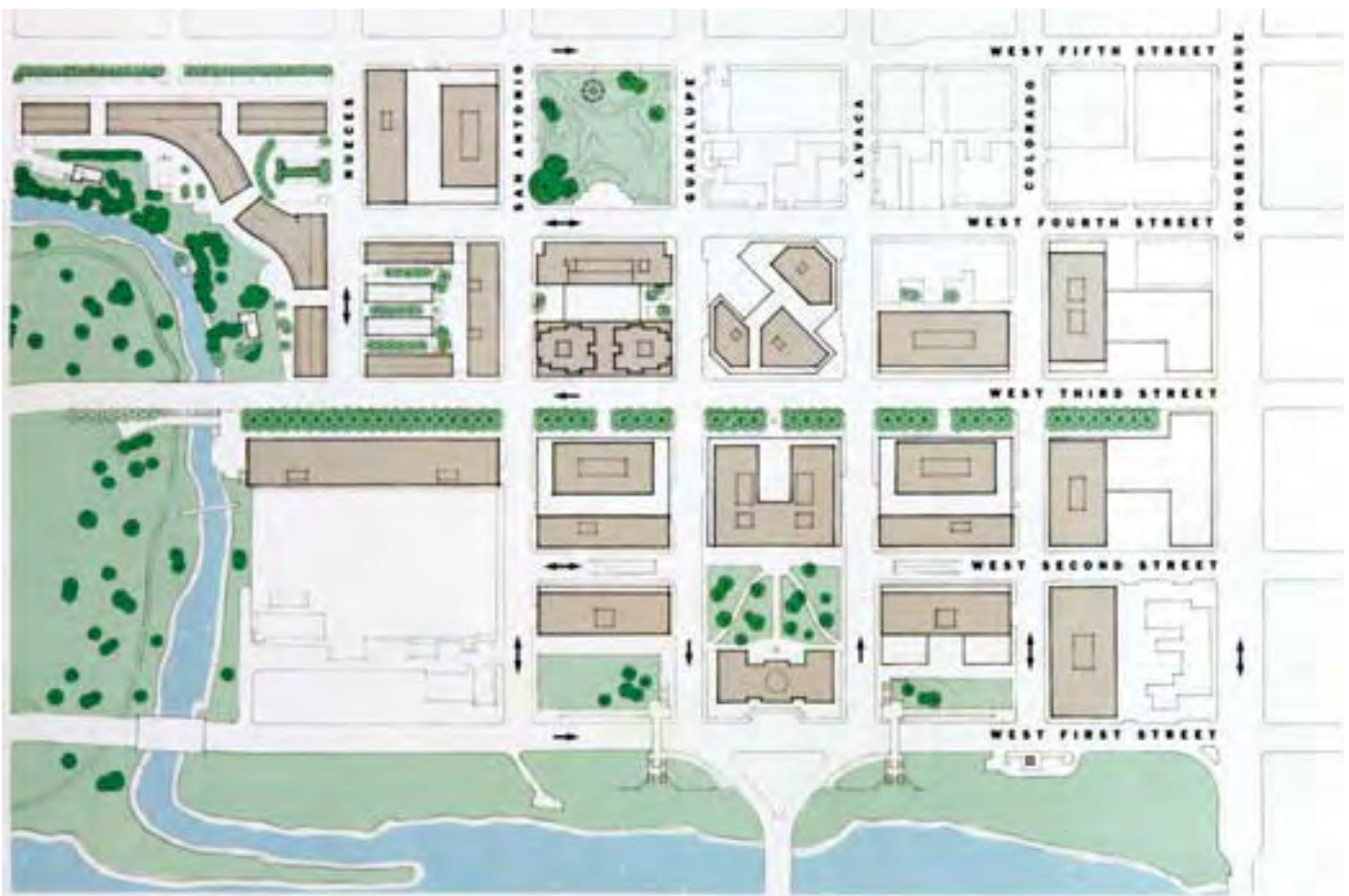
REPUBLIC SQUARE DISTRICT AUSTIN, TEXAS